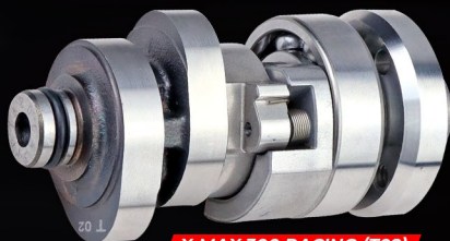
X-MAX 300 RACING (T02)