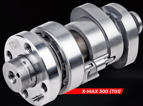
X-MAX 300 (T01)

The duration angles of TDR Racing Camshaft are designed to support Bore Up Engines. Made of material for high durability.