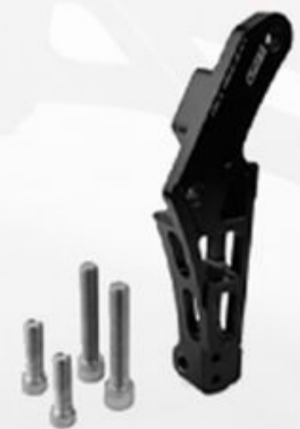
VECTOR BRACKET AXIAL 298MM