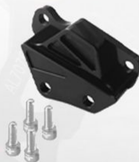
BRACKET AXIAL 298MM