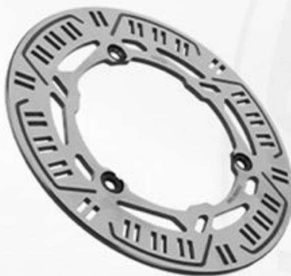
MATRIX REAR DISC ROTOR 245MM