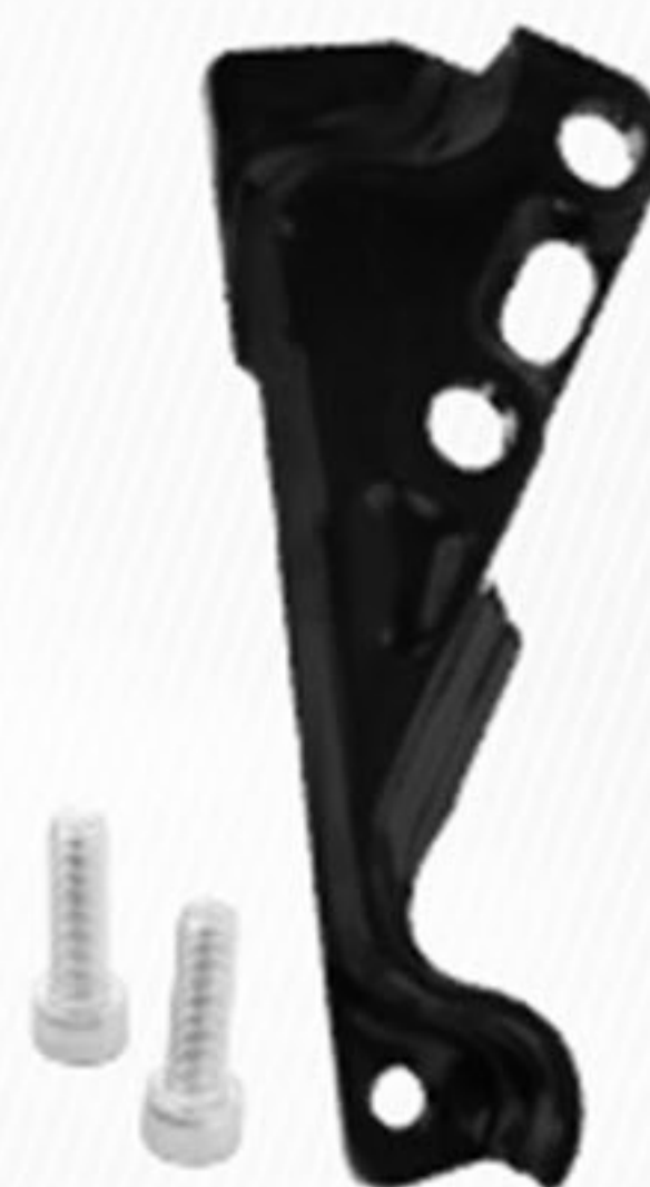
BRACKET CALIPER AXIAL PCX 160 ABS / CBS 260 MM