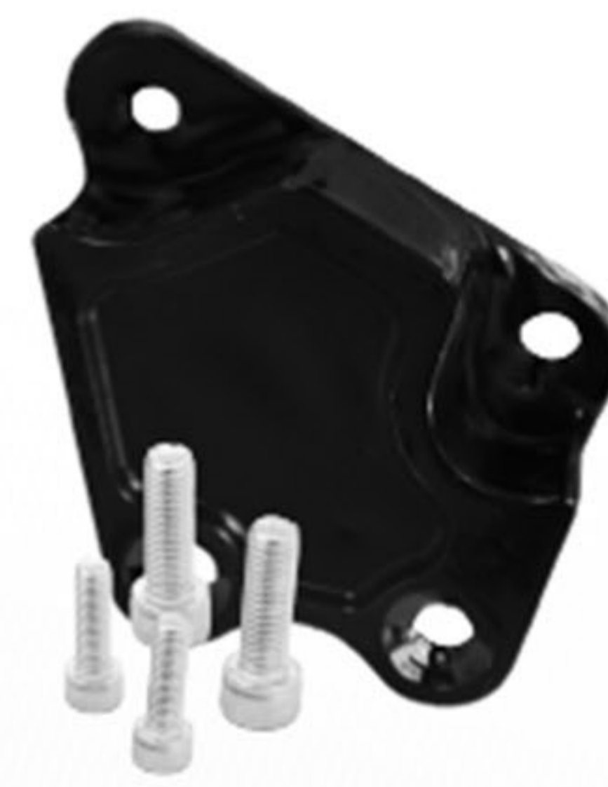
BRACKET CALIPER AXIAL N-MAX / AEROX 230 MM + BOLT