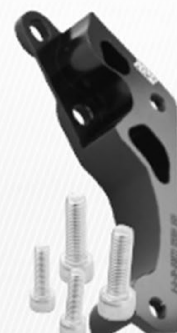
BRACKET CALIPER AXIAL VARIO 125 / 150 / 160 CBS 260 MM