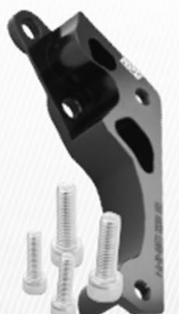
BRACKET CALIPER AXIAL BEAT SERIES 260 MM