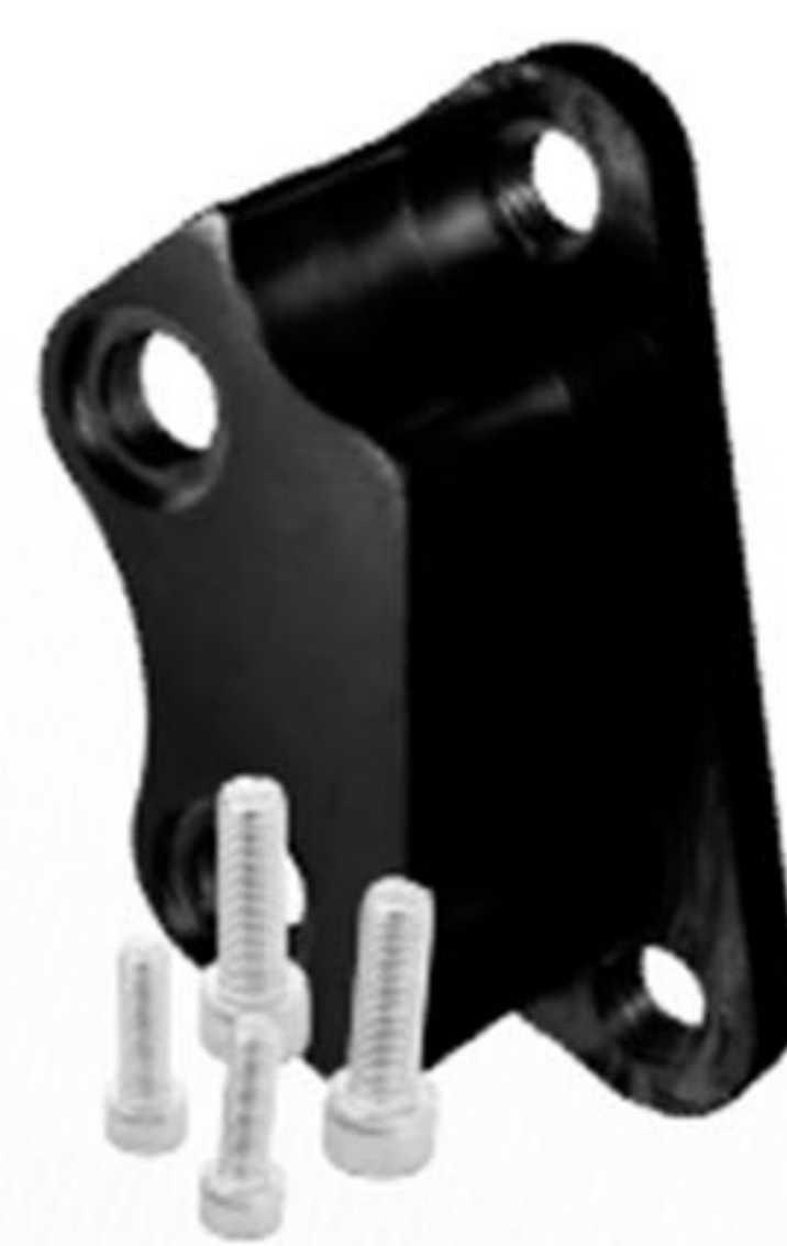
BRACKET CALIPER AXIAL N-MAX / AEROX 260 MM + BOLT