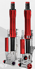
RED / BLACK / SILVER / RED