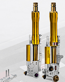
GOLD / GOLD / SILVER / GOLD