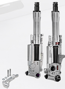
SILVER / BLACK / SILVER / BLACK