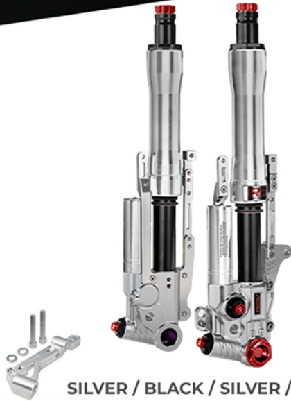
SILVER / BLACK / SILVER / RED

Initial spring preload adjustment 10 clicks