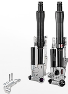
BLACK / BLACK / SILVER / BLACK