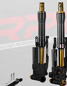
BLACK / GOLD / BLACK / GOLD